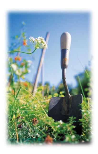
Current as at July 2023

Disclaimer: All effort has been made to ensure that the information contained in this brochure is correct at the time of publication. However the information in this brochure is subject to change.